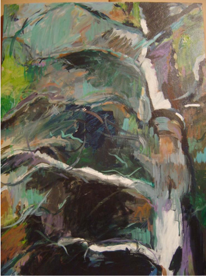
Tree, acrylic on canvas, 18X24, 2005 ©

This painting required the use of both brushes and painting knives. Often artists will choose to combine tools in order to create spontaneous effects in the work of art. The artist must however know enough about the expected outcome of a particular technique or tool, and this generally comes with experience and trial and error. A painting is really a combination of intention, form, and content. Technique is important, but technique alone will not win the day for you, and will likely create ever more obstacles on the road to artistic development---AHM